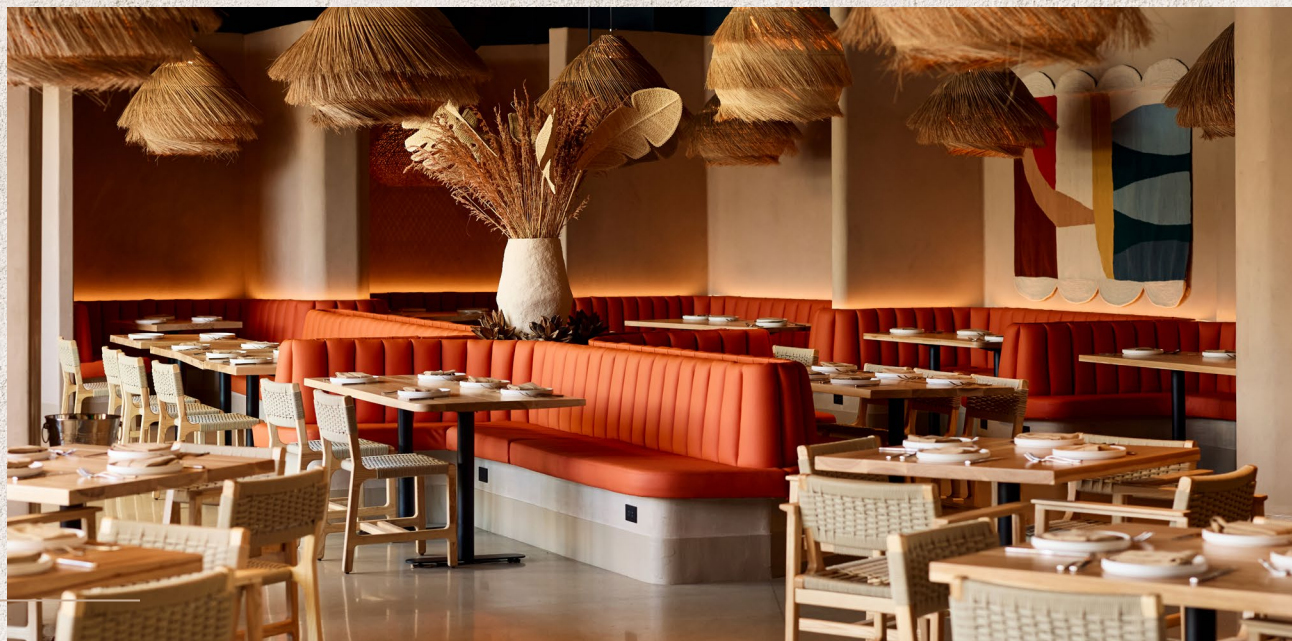
2. Main Dining