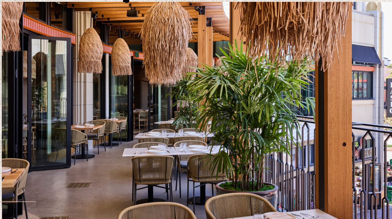
8. Balcony | Sunrise