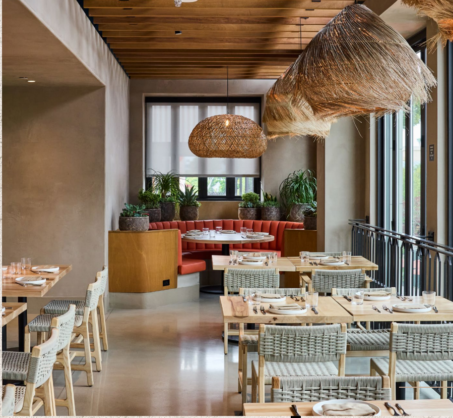
7. Del Rey