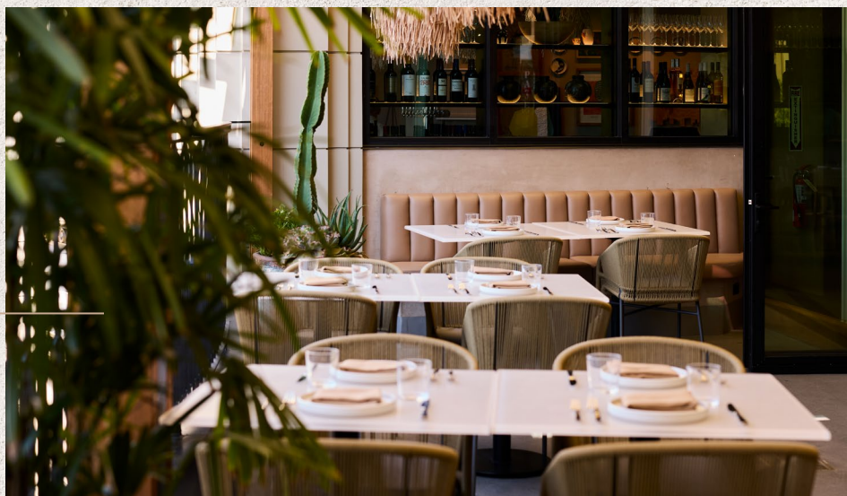
9. Balcony | Sunset