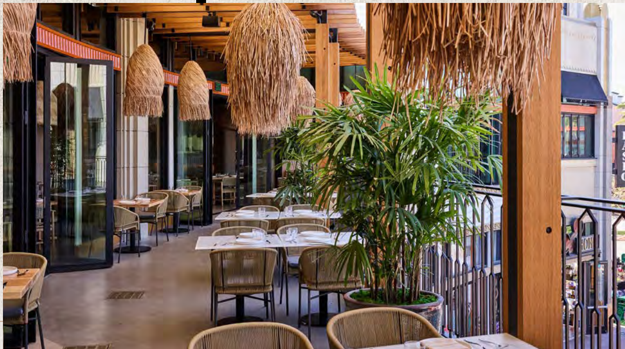
8. Balcony | Sunrise